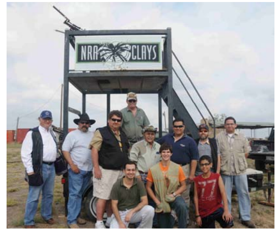
Participants from a 2009 Sporting Clays Match